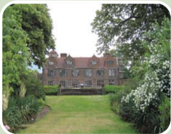
Castle Bromwich Hall

Turn right onto Kingsleigh Drive and follow the road down to its junction with Chester Road. In front of you is St. Mary and St. Margaret's Church 8 . At this point there is an opportunity to deviate from the walk and visit Castle Bromwich Hall Gardens 9 , the entrance to which is to your right. If you do not wish to visit the gardens, turn left onto Chester Road, follow the road down past the Church and then Castle Bromwich Hall which will be on your right hand side. Shortly after you pass the Hall you will come to a roundabout. In front of you is the Parish Council open space known as Bradford Gardens. At this point turn left and follow this road which will take you past the village green 10 and then on to your start point at Arden Hall 1 .