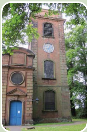
St Mary and St Margaret's Church