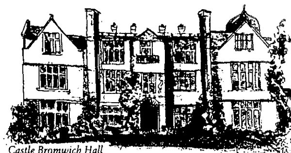
Castle Bromwich Hall