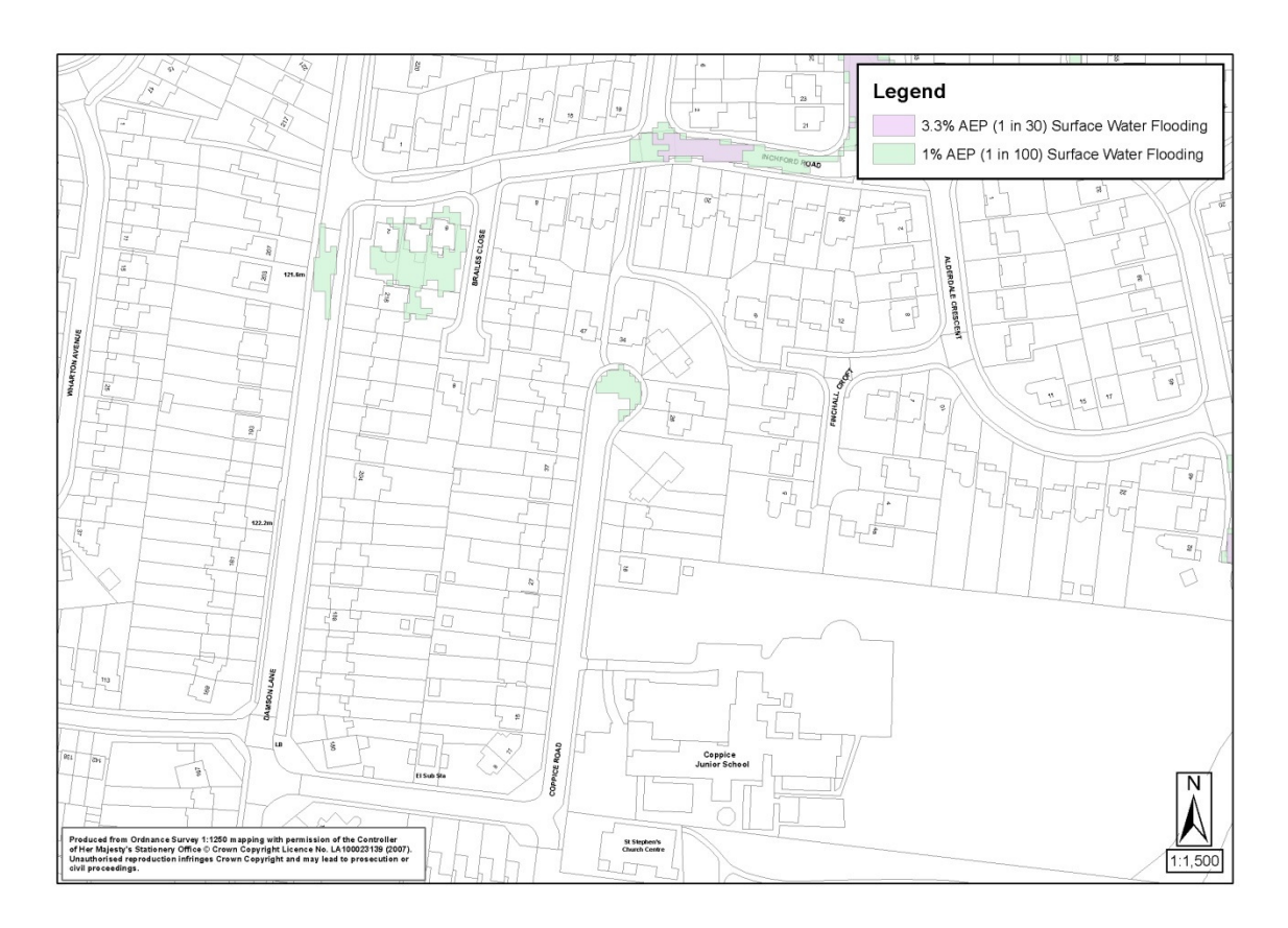
Figure 5 - Surface water flood map within the Coppice Road area, Elmdon