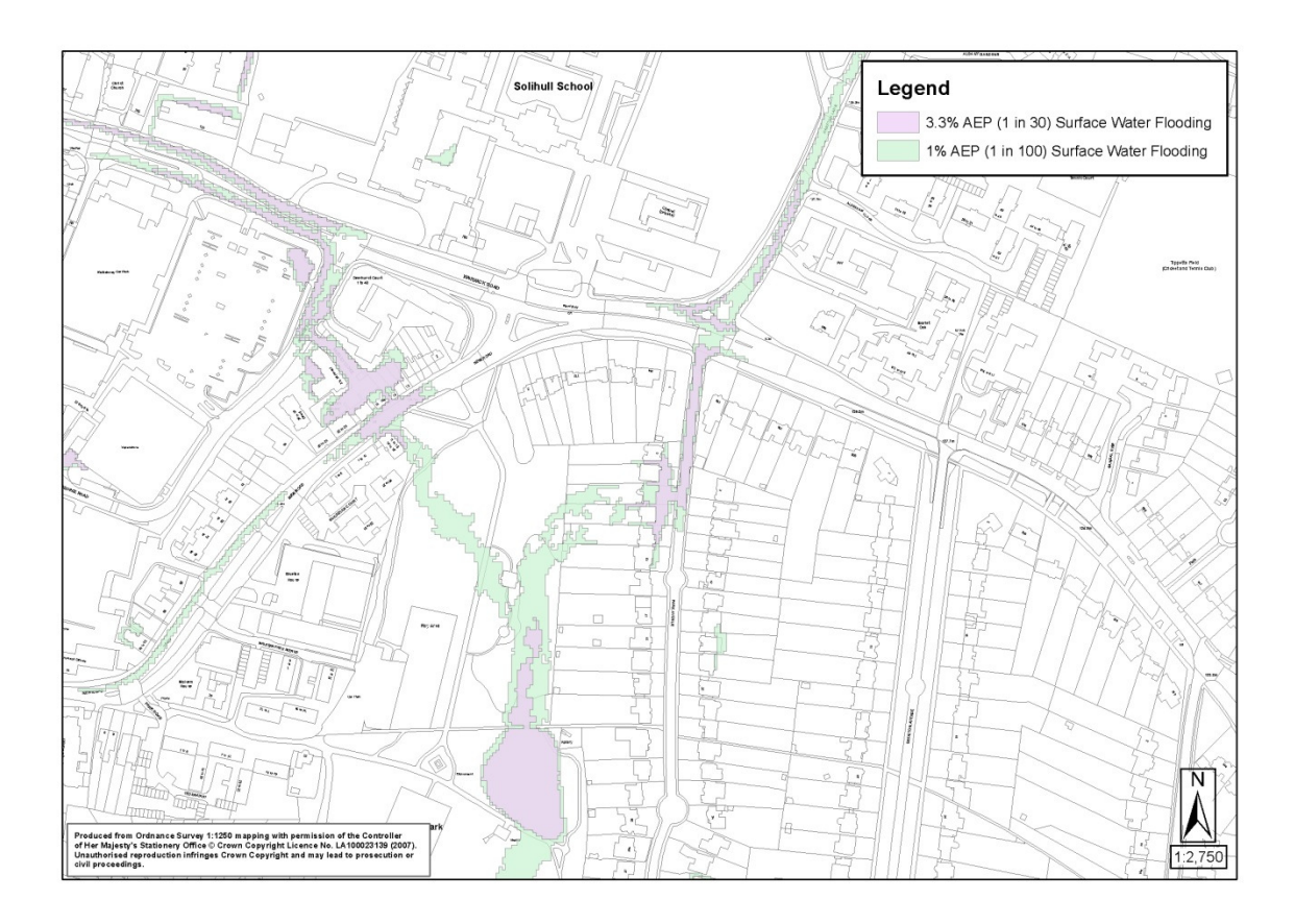
Figure 1 – Surface water flood risk within the New Road & Park Avenue Area, St Alphege