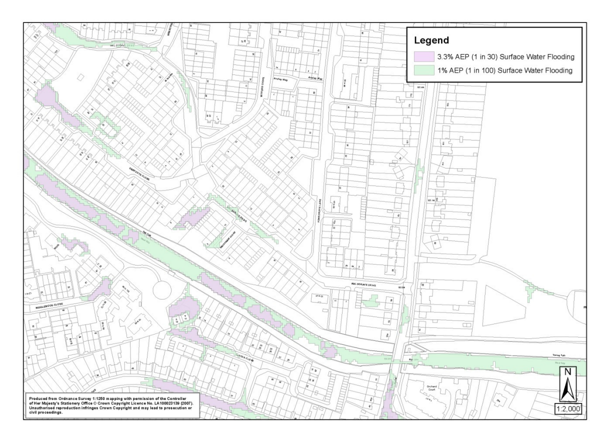
Figure 3 – Surface water flood risk within the Foredrove Lane, Damson Lane and Walsgrave Close area, Elmdon.