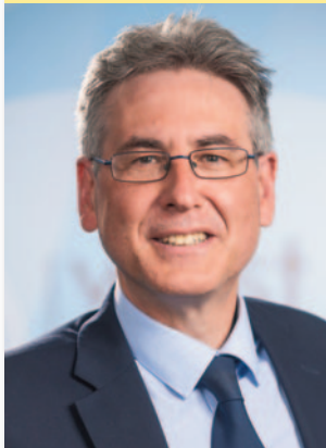
Police and Crime Commissioner Simon Foster

The West Midlands Police budget remains under severe pressure. The total government grant settlement for the West Midlands in 24/25 is £629.2 million, which is an increase of £39.3 million on the 23/24 settlement.