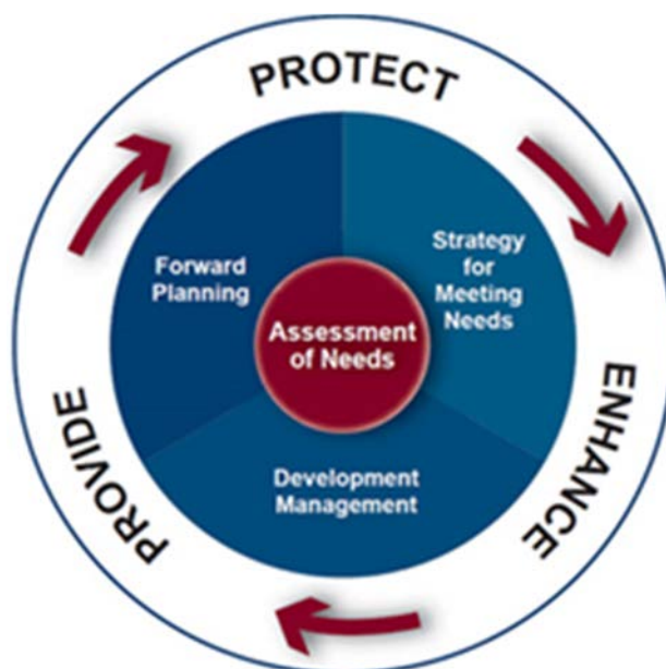
Figure 1: Sport England themes

To provide new playing pitches where there is current or future demand to do so